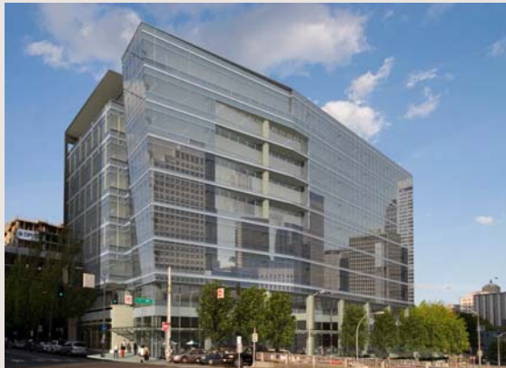
7th Avenue and Madison Street