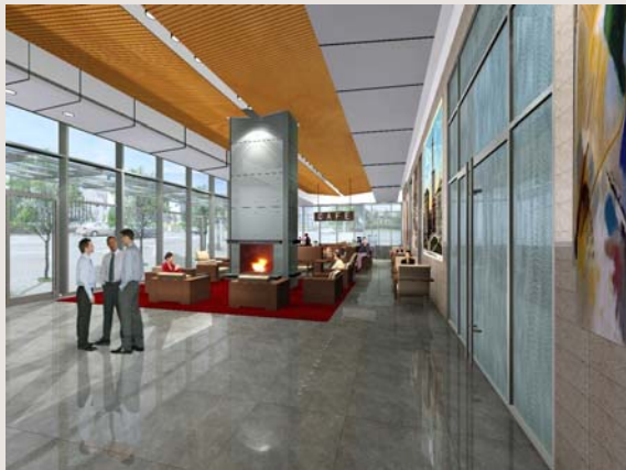
7th Avenue and Madison Lobby