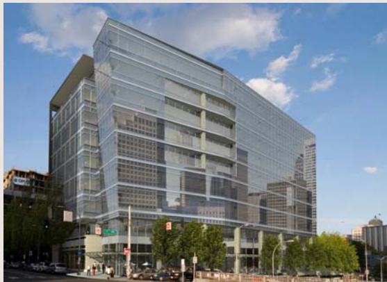
7th Avenue and Madison Street