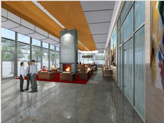
7th Avenue and Madison Lobby